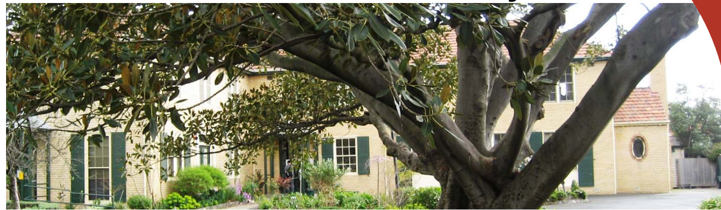
An Alcohol and Other Drug Treatment and Education Agency